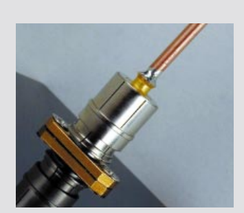
Leave plug collar retracted for convenient snap-on mating (ideal for component testingrepeated mating will not damage SMA jacks).