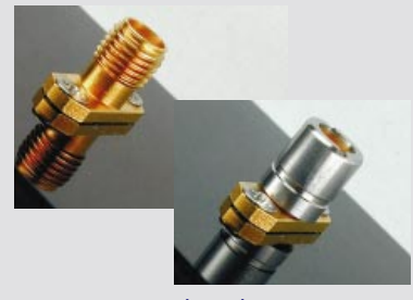
Just screw the adapter onto any SMA jack—no torque wrench needed.

Call for more information, and see how the versatility of EZ QuickSnap plugs and cable assemblies can liberate your system design.